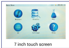
7 inch touch screen