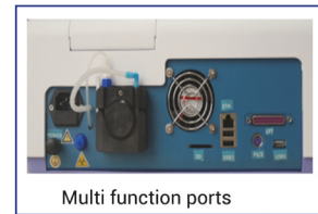
Multi function ports