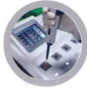
Step three pipette anti-serum into the cuvette